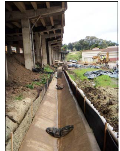
S-Fence 20" installed on both sides of concrete V-Ditch