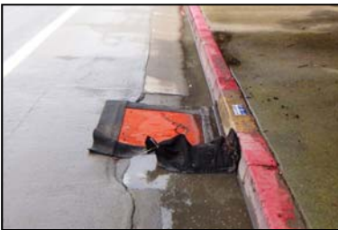
ERTEC GR8 Guard™ Drain Inlet Protection