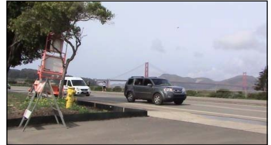
The project is located alongside San Francisco Bay

The Challenge: The current best practice is to use traditional silt fence to keep sediment from moving off-site. Unfortunately, it is common to see silt fence topple in the wind, break down in UV light or allow ponding and undercutting during storms. Road Construction projects often last 18 months or more and it is typical for a large percentage of the silt fence installation to require maintenance or even complete replacement. Estimators often overlook the cost of silt fence maintenance, removal and waste handling. Proper installation, removal and disposal is costly. On multi-phase projects, it is also desirable to relocate and reuse the BMP as construction progresses, rather than dispose and start a new phase with new materials.