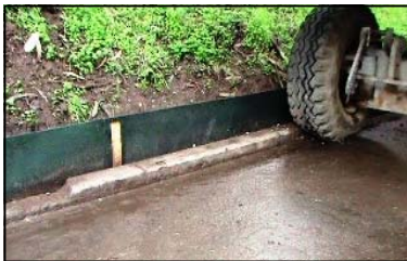
S-Fence™ - protection at base of slope

“This stuff is easy to work with but also easy on our labor force due to its light weight and ease to transport in and around the job site.” - Tim Jones, Estimator & Project Manager, Green Vista Landscaping