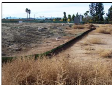
Perimeter & stockpile protection