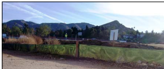
Environmental Management—Heery International, Barnhart, Inc.