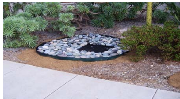
Edge Guard with rock, used around a drain inlet as long term protection from sediment.