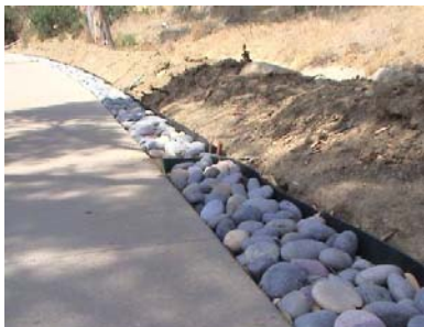
Edge Guard with rock, used as an effective edge treatment

ERTEC Edge Guard™ (EG): EG was used as an edging device throughout the SIO property—at the base of slopes protected by PW, around drain inlets, traffic islands, small drainage areas, perimeters with new sod, mulch & topsoil. EG filters and allows water to flow-through which prevents mulch and sediment overtopping. EG (“I” shaped) has all the same flow spreading and filtering capabilities as PW (“L” shaped) and is intended for protecting perimeters and edges in flat or nearly flat areas.