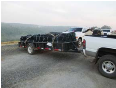
8,000 LF on trailer