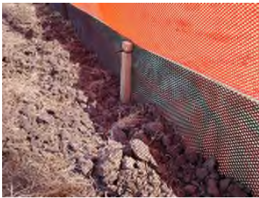
ERTEC Sediment Control