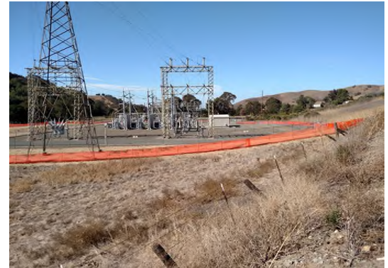
E-Fence Triple Function Barrier Installed Around Substation During Construction