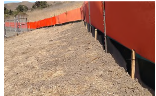
Sediment Control Installed to Control Run-On