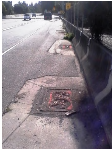
CA Route 13 May 2016

GG works well if periodic run-overs, but does not survive long in constant stop-and-start traffic. Sweep clean after every storm or as necessary.