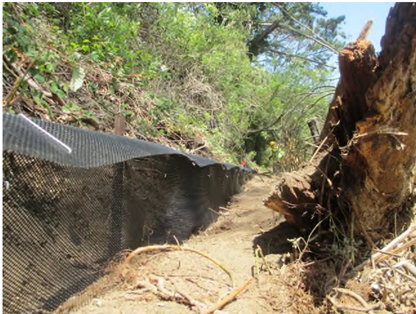
Photo 3: E-Fence™ with 5" climber barrier. About 10" tall and positioned between Mountain Lake and HWY 1 to contain PCF