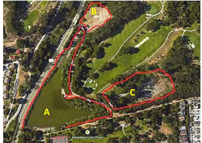
Fig. 1: Area A: Lake and wetlands; Area B: Northern Habitat; Area C: East Arm

Mountain Lake is located at the southern boundary of the San Francisco Presidio. The Lake area and bordering national park offer a contiguous multiple-use recreational area. Its surrounding natural environment provide potential plant and wildlife habitat, attracting many waterfowl and migratory bird species. In addition to problems associated with its location in the urban landscape, the management of Mountain Lake is further complicated due to the various jurisdictions of its borders: city park, state highway, national park, and private golf course. Mountain Lake had experienced a severe degradation of its environment related to these diverse boundaries. Mountain Lake and its surrounding area is currently undergoing a long and comprehensive restoration process. It has been dredged and cleansed of sediments and toxic chemicals that have poisoned it for a century. Non-native fish and vegetation have been removed. The Lake's natural vegetation has been restored to provide new wildlife habitat. Conservationists have reintroduced native species like Western pond turtles and Pacific chorus frogs.