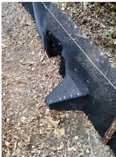
Photo 2: Funnel in both directions allow small animals to move between areas (frogs, rodents)

Application: Wildlife Containment and Directional Control Product: ERTEC E-Fence™, 20" width, black for permanent installation, with and without climber barrier Project: Mountain Lake Restoration Owner: San Francisco Presidio