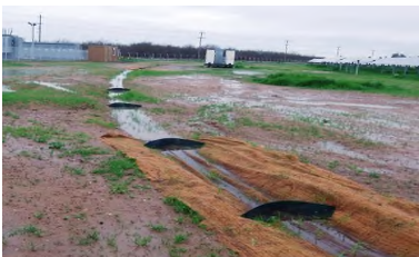
ProWattle™ used as a check-dam

The Challenge: Current best practice is to use either silt fence or wattles to keep sediment from moving off-site. In this application, wattles and silt fence can become ineffective by allowing damming and undercutting. As the straw or fence material decays, storm water flow through and overtopping becomes common. Solar Plant construction projects often last 18 months or more and it is common that a large percentage of the wattle or silt fence installation must be maintained or replaced. ProWattle™ can overcome the above concerns, provide better risk management, and provide a significant economic advantage to the builder.