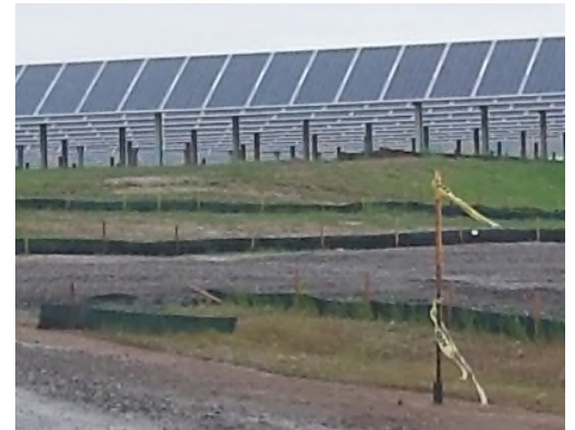
ProWattle™ can be used on Perimeters, Slopes, and Swales.

The Challenge: Current best practice is to use either silt fence or wattles to keep sediment from moving off-site. In this application, wattles and silt fence can become ineffective by allowing damming and undercutting. As the straw or fence material decays, storm water flow through and overtopping becomes common. Solar Plant construction projects often last 18 months or more and it is common that a large percentage of the wattle or silt fence installation must be maintained or replaced. ProWattle™ can overcome the above concerns, provide better risk management, and provide a significant economic advantage to the builder.