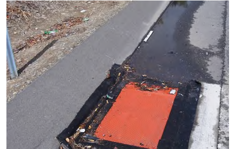
Early in the project

GR8 Guard™ is a patent pending, low cost system designed to keep sediment and debris out of grated storm drain inlets in paved areas. The berm layer forces water to rise to at least 1.5 inches before reaching the filter causing heavier particles to settle. The system filters storm water above the ground easing visual inspection and maintenance. The system has a high flow bypass designed to reduce the chance of back ups. It is easy to fasten to the grate with rebar tie-wire, has a long life, is resistant to traffic, and reusable. Grates do need to be removed, during installation or cleaning, reducing installer injuries and worker's comp claims.