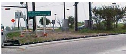
S-Fence ™ Reflector: Day and Night images