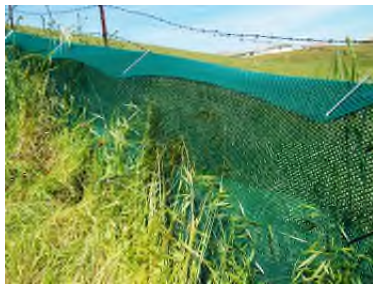
Optional barrier lip available to contain climbers