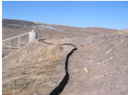
CO Department of Mining Safety & Reclamation (DRMS)