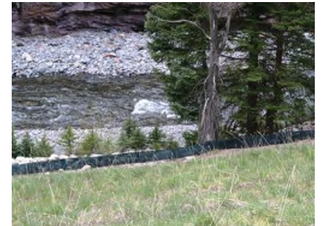
Idarado Mine, CO – Newmont Mining Corp 3 years after install – no maintenance required