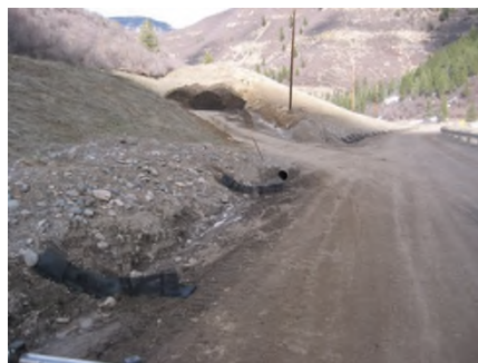
Arch Coal, CO