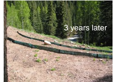
4 Seasons in the White River National Forest (Hope Mine Site), an AML*. Project is at 8,000 feet 300 inches of snow. S-Fence™ does not decay, blow down, undermine easily, or crush from snow-pack.